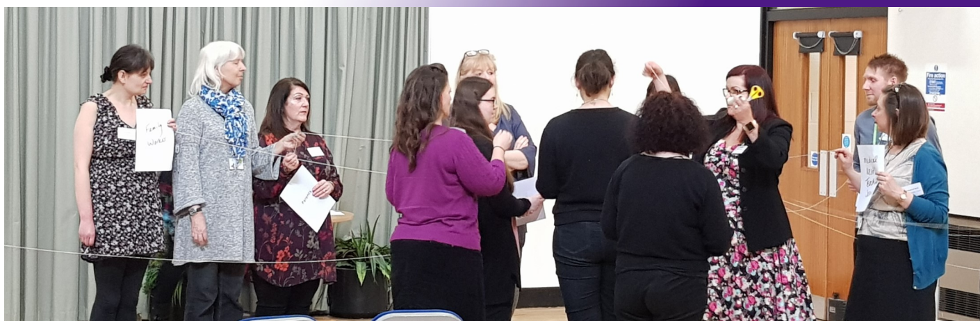
VOCypf Forum Group Exercise, March 2019, Delegate comment: "very useful visual exercise to remind us of how many organisations/individuals could be involved and how this feels to a young person."